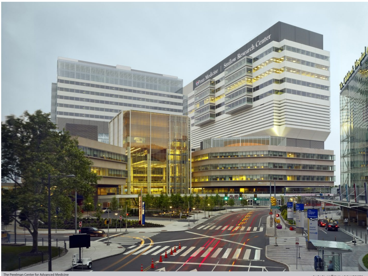
The Perelman Center for Advanced Medicine